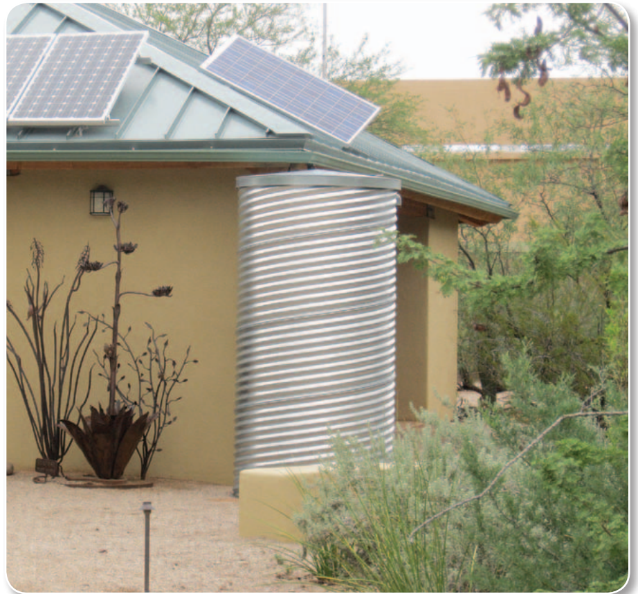
One of the Water harvesting tanks at Tucson Botanical Gardens.

“What we’ve been trying to do is make water supply reliability relevant to the business CEOs and community leaders,” he said. “And the business community needs to understand that they’ve